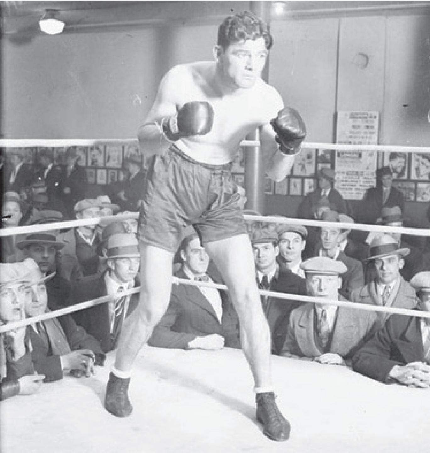
Boxer James Braddock.

it for very little. It will not only define and shape your future, it will put both a concrete floor under it and an iron ceiling over it. It's what the world will remember you for more than probably anything else. It's not your looks, it's not your talents, it's not your