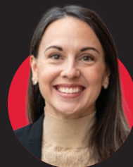
By Molly Macek Director of Education Policy

Students also had the opportunity to speak with legislators and visit the Senate gallery. The schools at the event were great examples of the valuable educational options made possible through school choice. ■